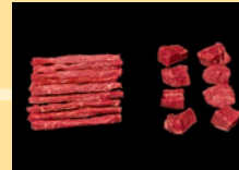
Beef for Stir-Fry and Kabobs