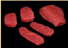
Beef Round Sirloin Tip Side Steaks and Breakfast Steaks