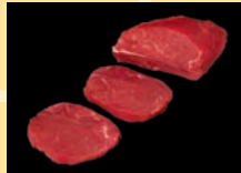
Beef Round Sirloin Tip Center Steaks