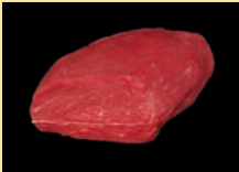
Beef Round Sirloin Tip Center Roast