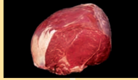
Beef Round Knuckle, Peeled IMPS/NAMP 167A