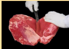
Tip Side/Tip Center