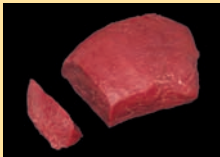
Round Tip Side