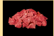
Beef for Stew